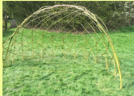
Living Willow arbour

These pictures of a tunnel show typical growth in the first season.